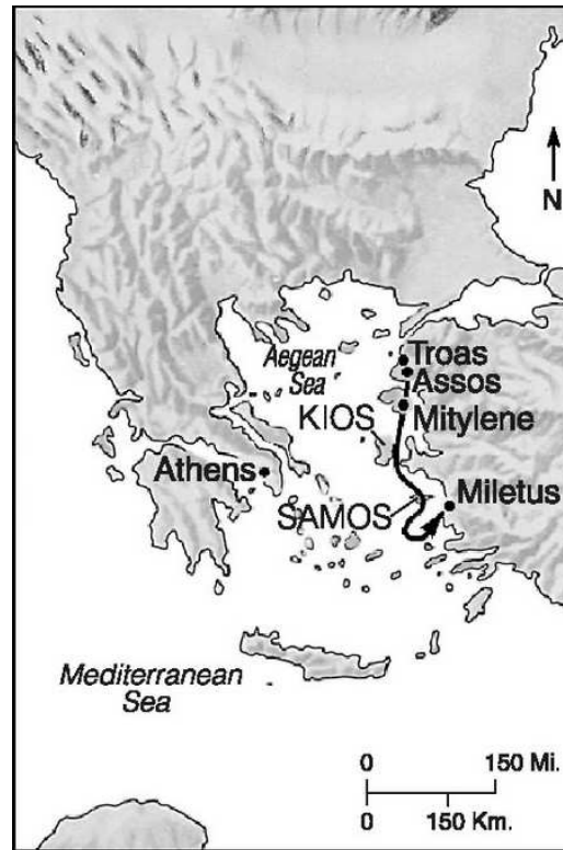
Paul Travels From Troas to Miletus

From Troas, Paul traveled overland to Assos, then boarded a ship to Mitylene and Samos on its way to Miletus. He summoned the elders of the Ephesian church to say farewell to them, because he knew he would probably not see them again.